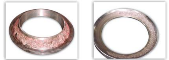
Circulating Water Pump bearing/race as found after APR notification of abnormal conditions