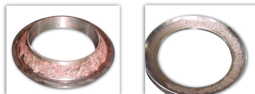
Circulating Water Pump bearing/race as found after APR notification of abnormal conditions